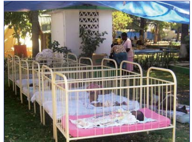
Makeshift tent hospital.