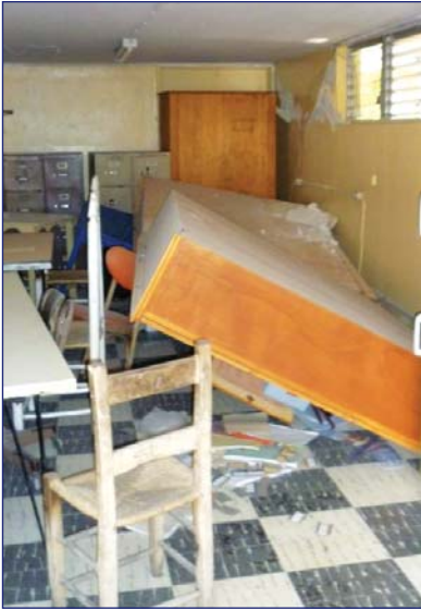
Classroom after the earthquake.

The earthquake did not totally destroy the hospital, however the damages sustained make it uninhabitable. As of Feb. 16, the children remaining at the hospital were cared for under outdoor awnings. On Feb. 17, a large tent was erected, which will be able to house the children. Those that remain are orphans. There were 20-25 children as inpatients at the time of the earthquake and one of them was killed.